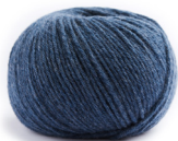
41M Jeansblau Dark Denim