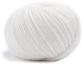
00 Natur Wool White