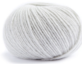
57M Marmor Marble