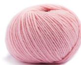
40 Altrosa Antique Pink