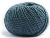
46 Basaltblau Basalt Blue