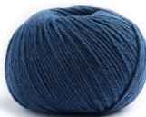
53M Nachtblau Night Blue