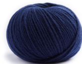
11 Marineblau Navy