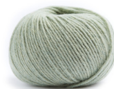
64M Salbei Sage