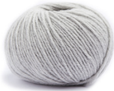
42M Hellgrau Light Grey