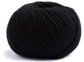
01 Schwarz Black