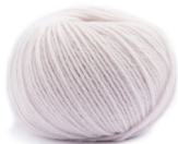
62 Rosenquarz Rose Quartz