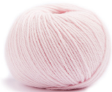
72 Kirschblüte Cherry Blossom