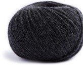
04M Anthrazit Anthracite