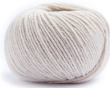
03M Seidengrau Silk Grey