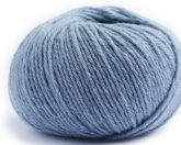
54M Eisblau Ice Blue