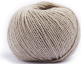
47M Muskat Muscat