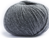
28M Schiefergrau Slate Grey