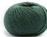
51M Moosgrün Moss Green