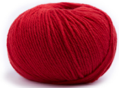
33 Karmin Carmine